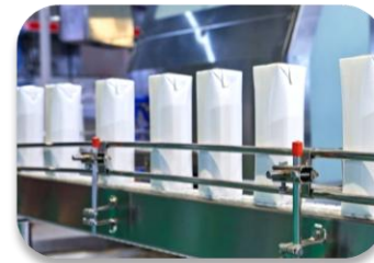
Flim & Packaging