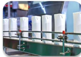
Flim & Packaging