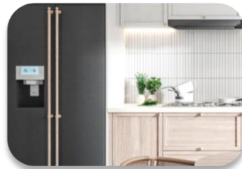
Houseware & Toy