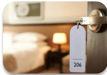
Hospitality & Promotional