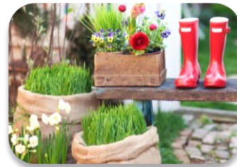
Lawn & Garden